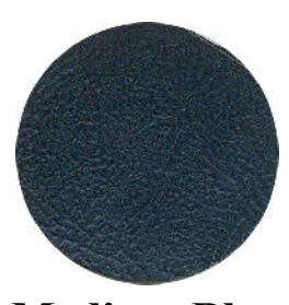
Medium Blue 154 or L-2505