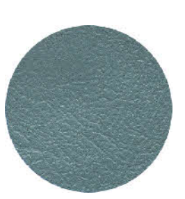
Light Blue 156 or L-2287