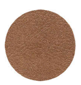
Palomino 152 or L-2288