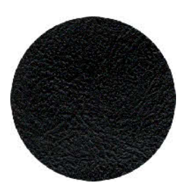
Black 101 or L-958