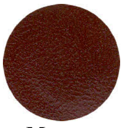
Maroon 164 or L-3116