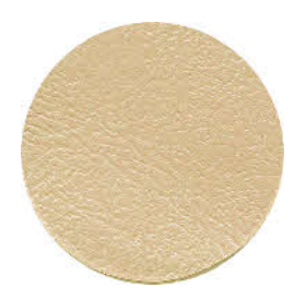
Pearl White 151 or L-2290