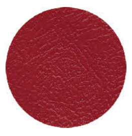
Red 153 or L-957