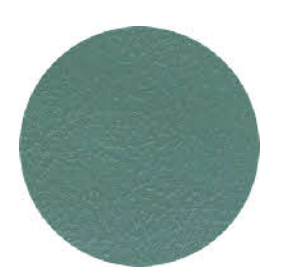
Light Turquoise/ Aqua 159 or L-2929