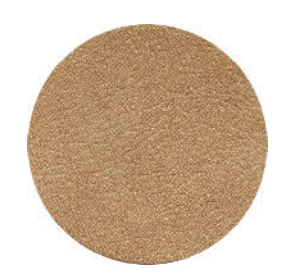
Parchment 158 or L-2613