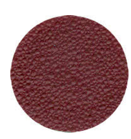
Dark Red 19