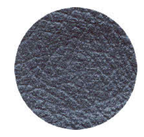
Dark Blue 160K or L-3435