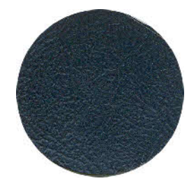
Blue 154 or L-2505