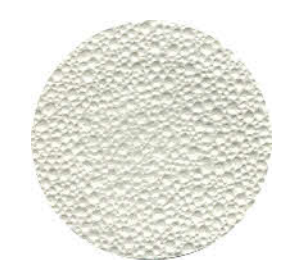
Light Parchment 51