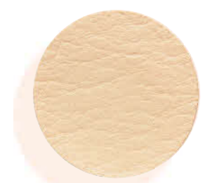
White 166R or L-4072