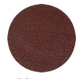
Maroon 167 or L-3724