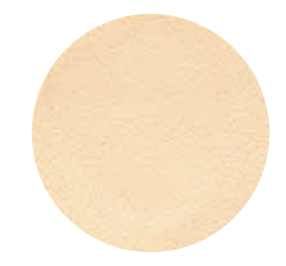
White 166 or L-4062