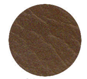
Ginger 170R or L-4070