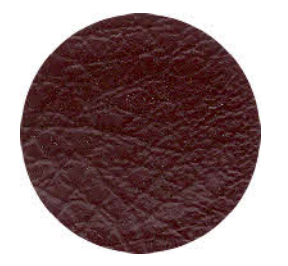
Maroon 164K or L-3440