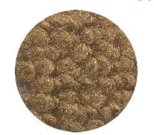
Brown (Saddle) 65 (614)

Note: New Color Numbers Are In Parentheses