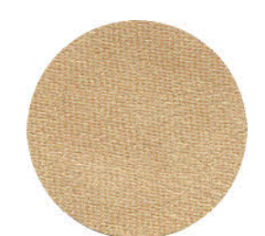
Parchment 161 or L-3096