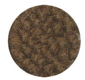
Ginger 82 (620)