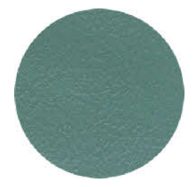
Light Turquoise 159 or L-2929