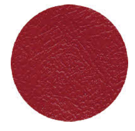
Red 153 or L-957