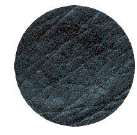
Dark Turquoise 163K or L-3474