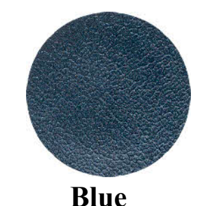
168 or L-3788