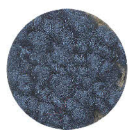
Ford Medium Blue 72 (606)