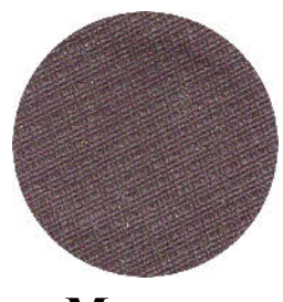
Dark Brown 30