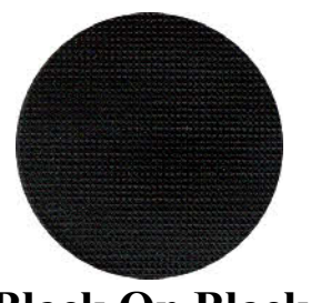
Black On Black CV21