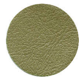
Ivy Gold 155 or L-2503