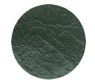
Green 169R or L-4060