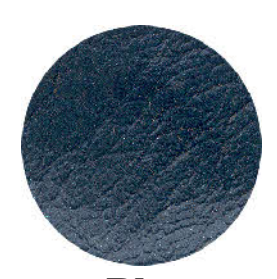
Blue 168R or L-4069