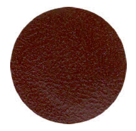
Maroon 164 or L-3116