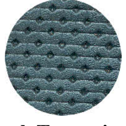
Dark Turquoise 163S or L-2951