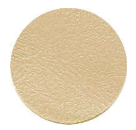
White 151 or L-2290