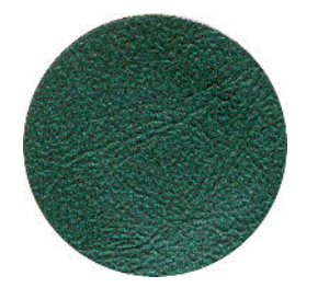
Dark Turquoise 163 or L-3097