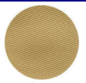
Tan On Black CV24