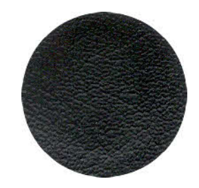
Black 165 or L-3722