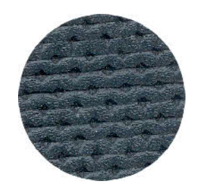
Dark Blue 160S or L-2946