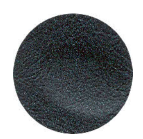
Dark Blue 160 or L-2505