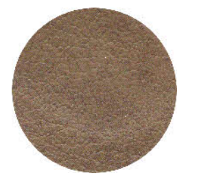
Ginger 170 or L-4061