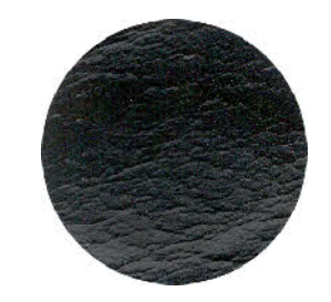
Black 165R or L-3400