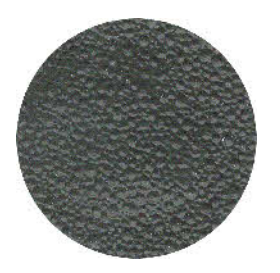
Dark Green 10