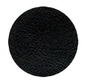
Black 101 or L-958