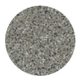
Tan/Gray Speckled 18

Every effort has been made to accurately depict the colors of our materials, however, variances in dyes, printer toner and even the paper used can affect this, so please use this sample card as a reference only.