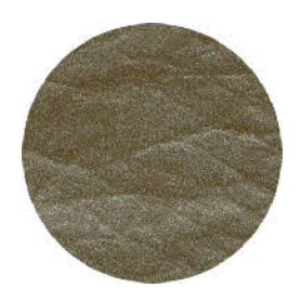
Dark Ivy Gold 162K or L-3530