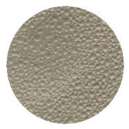
Light Ivy Gold 18