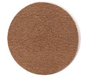
Palomino 152 or L-2288