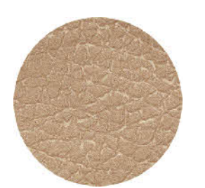
Parchment 161K or L-3443