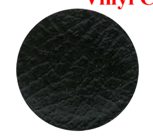
Black 101K or L-3437