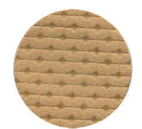
Parchment 158S or L-2954