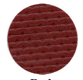
Red 157S or L-2954