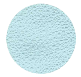
Light Aqua 15