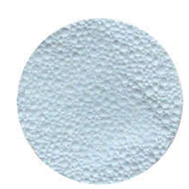
Light Blue 14