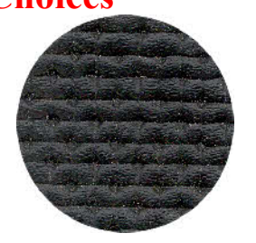
Black 101S or L2949