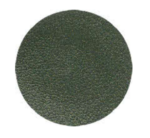
Green 169 or L-4234